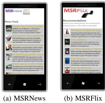
Figure 2: Demonstration Applications